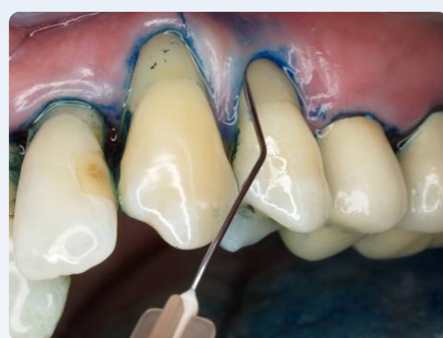
Application of HELBO® Blue Photosensitizer from apical to coronal direction!