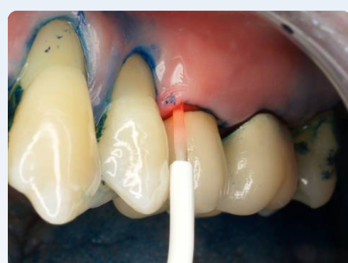
Light exposing with the HELBO® TheraLite Laser for 1 min per tooth

aPDT was performed with a diode laser (wavelength, 660 nm; diode power 100 mW; HELBO®, bredent medical, Senden, Germany) in combination with a dedicated photosensitizer dye solution (phenothiazine chloride; HELBO®, bredent medical).